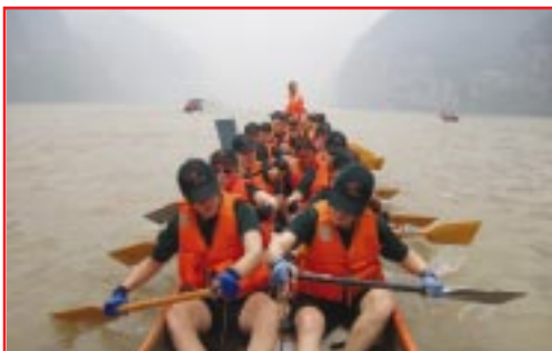
OzDragons (mixed team) competing in the 4th China Yangtze River Three Gorges Dragon Boat 39km Relay.

The trip was a success. We came home with 2 huge trophies, medals, grins from ear to ear, and many stories. We are looking forward to the start of the next Australian racing season, beginning this September.