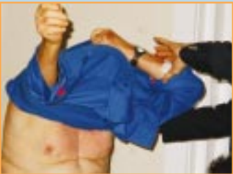
Only a Life Member is allowed to undress for dinner!